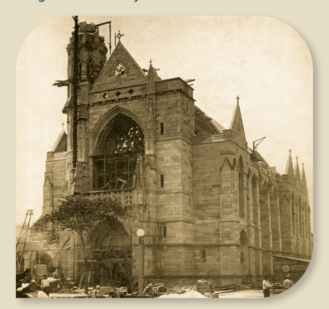
Fourth Presbyterian Church under construction, August 1913

Building on this foundation, legacy gifts made over the past 100 years contribute to the church's financial stability and support our mission: to be a light in the city.