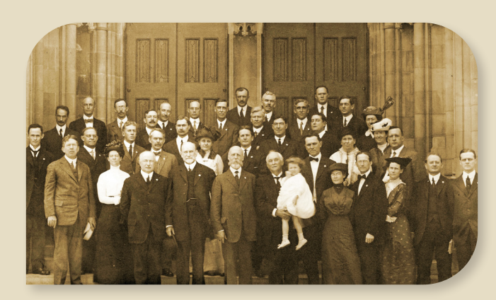
Attendees of the 125th General Assembly pose on the steps of the newly completed church, May 1914

We share a deep sense of gratitude for those who have gone before us. Their gifts have helped sustain the church and provided for the well-being of those who would follow them in ministry.